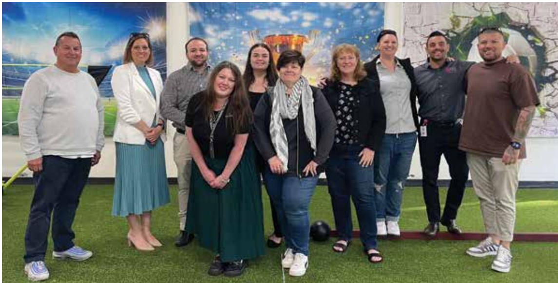
Breakfast club at the activity centre