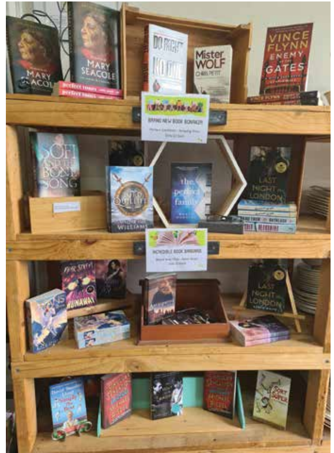
Display of brand new books.

moments - from summer heat waves to unexpected traffic disruptions - our community's support hasn't wavered. In fact, our recent International Day of People with Disability celebration saw sales soar nearly 37% compared to last year's event.