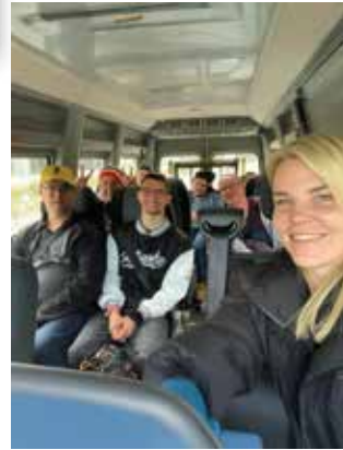
Fairhaven Out 'n' About Day at the Sydney Zoo.

3 Supports Tara, Enya, Warwick and 10 dedicated Adventurers